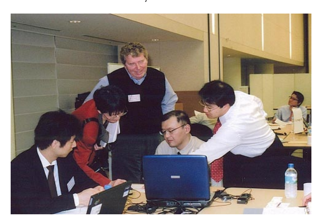
Thanks to the promotion by ASAF member societies, we received participants from Korea, P.R. China, and U.S..

The seminar was particularly useful for those who are extensively involved in global investments and drew a large participants approximately 110 and provided them with latest knowledge and investment strategic skills through intensive sessions and case study.