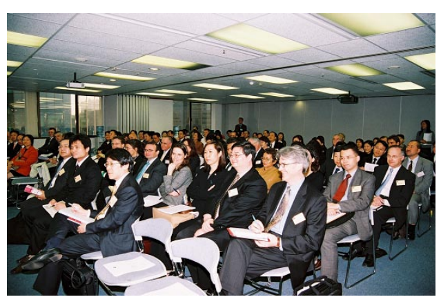
Full house for the Executive Briefing on High-level Principles for Business Continuity